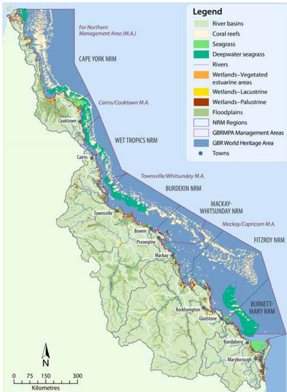
Figure 2: Map of the marine natural resource management (NRM) boundaries, coastal aquatic and marine habitats, NRM regions and catchment boundaries included in the 2017 Scientific Consensus Statement. Map prepared by D. Tracey, James Cook University.

In parallel to the update of the Scientific Consensus Statement in 2017, new catchment-based pollutant load reduction targets were developed for the Reef 2050 Water Quality Improvement Plan (Brodie et al., 2017).